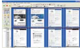
The AvScan 5.0 main screen

-The Intelligent Document Management Tool